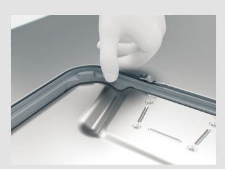
Check gasket (intact).