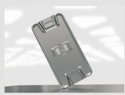
I Check for dents and deformations.