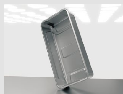
I Check for dents and deformations.