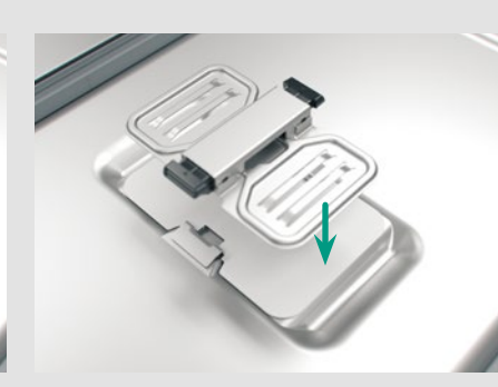
I Filter retainer snaps audibly into position and has full surface contact.