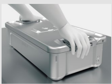
Close and seal the container. Only use Sterile container ready to use. undamaged sterile containers. If components are damaged, replace with original parts or repair immediately.